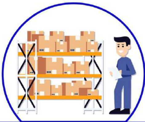
EXHIBIT24X7.com is a virtual or online exhibition with specific shortlisted sectors, in view of its growth prospects and global universal demand. With EXHIBIT24X7 you can demonstrate your products and innovations to millions of visitors globally visiting the site and connect with them.