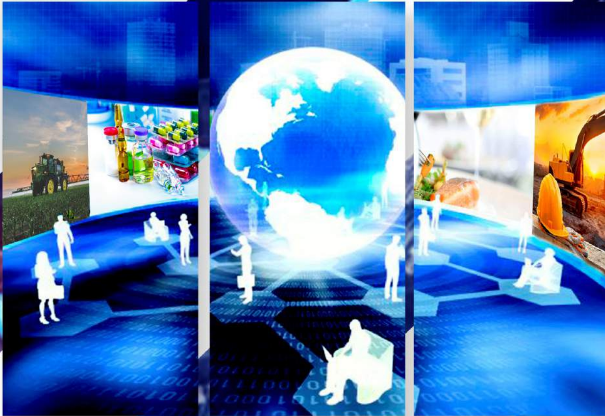
Exhibit Online to promote your product round the year